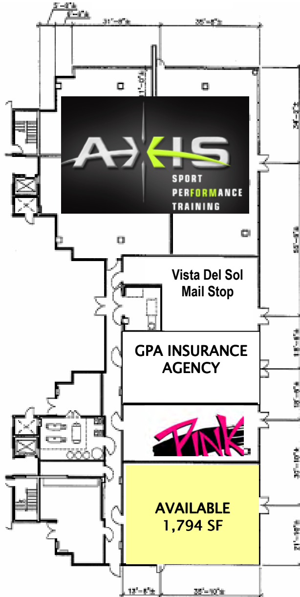
671 E. Apache